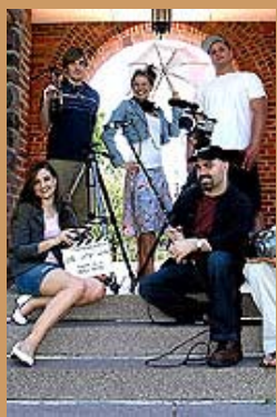
Subscribe to Show Business